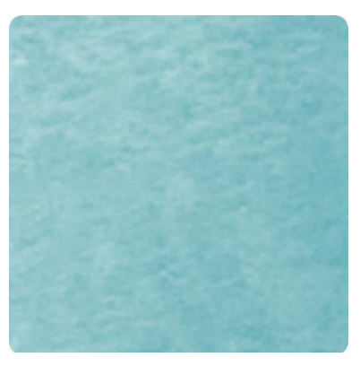
MS 502 (1% MS BASE 19)