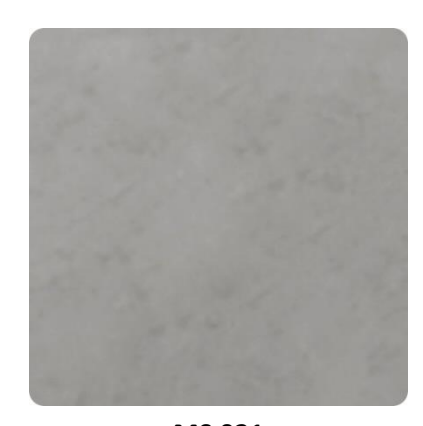
MS 021 (0.5% MS BASE 05)