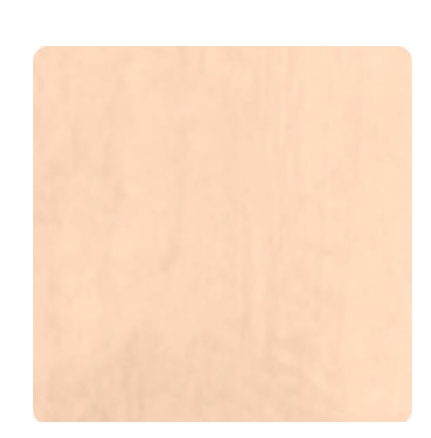
MS 105 (0.6% MS BASE 09)