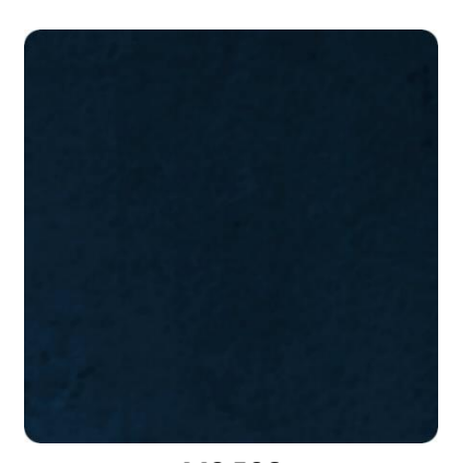
MS 506 (3% MS BASE 20 / 1% MS BASE 03)

Colours may change depending on monitor and printer settings. They are presented as a reference only. For colour specifications it is strongly recommended that a physical sample is produced. MICROSTONE® pigments are made of natural minerals. Note that unavoidable slight differences and irregularities, typical of natural products, are to be expected.