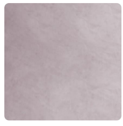
MS 030 (0.6% MS BASE 04 / 0.25% MS BASE 06)