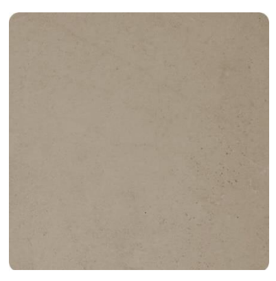
MS 104 (1% MS BASE 08)