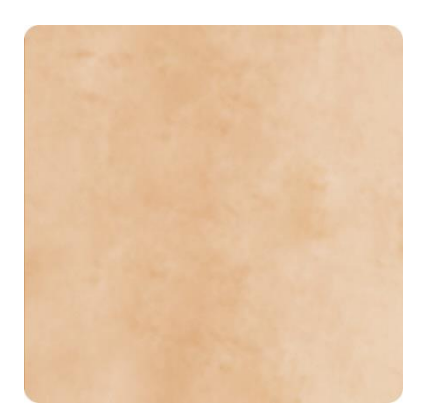
MS 106 (1% MS BASE 09)