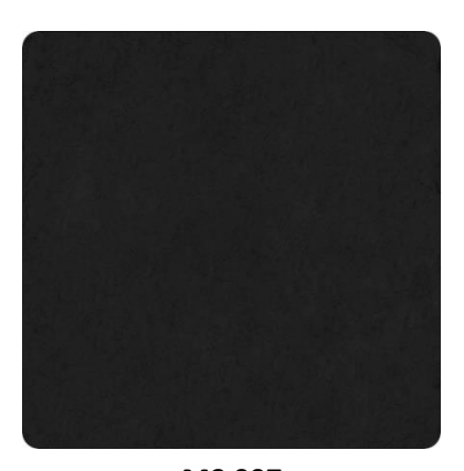
MS 007 (3.5% MS BASE 03)