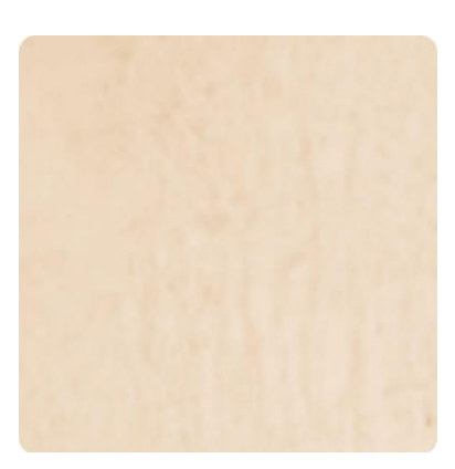
MS 102 (1% MS BASE 07)