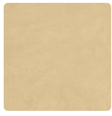
MS 202 (1% MS BASE 15)