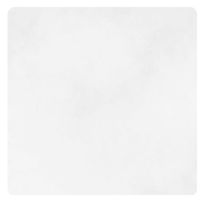
MS 001 (4% MS BASE 01)