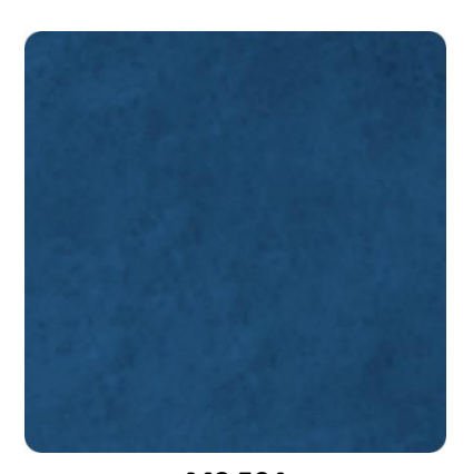
MS 504 (3% MS BASE 20 / 0.25% MS BASE 03)