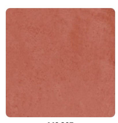
MS 307 (0.6% MS BASE 12)