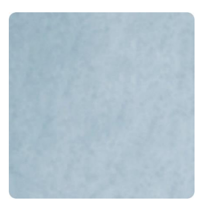
MS 031 (0.6% MS BASE 04 / 0.25% MS BASE 18)