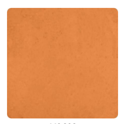
MS 306 (1% MS BASE 14)