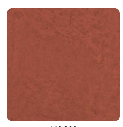
MS 308 (1% MS BASE 12)