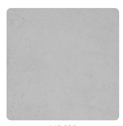
MS 020 (4% MS BASE 04)