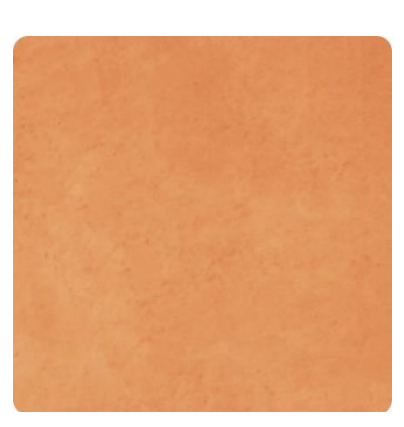
MS 305 (0.6% MS BASE 14)