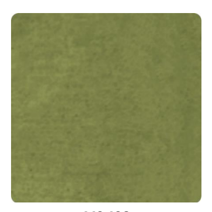
MS 406 (1% MS BASE 13 / 3% MS BASE 18)