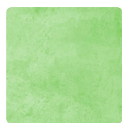
MS 404 (1% MS BASE 16)