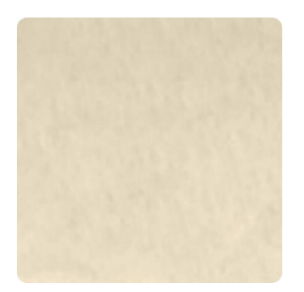
MS 201 (0.6% MS BASE 15)