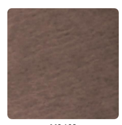
MS 108 (1% MS BASE 10)