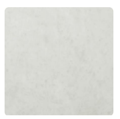
MS 004 (0.6% MS BASE 04)