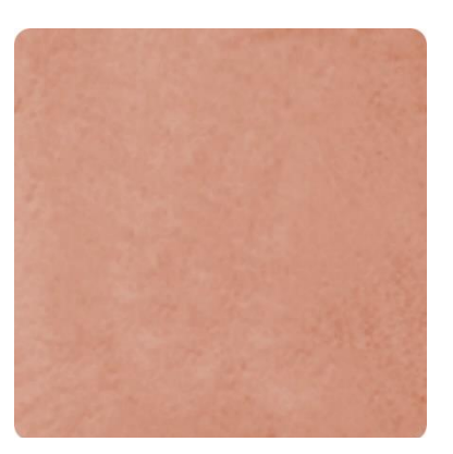
MS 303 (0.6% MS BASE 11)