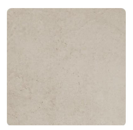
MS 103 (0.6% MS BASE 08)