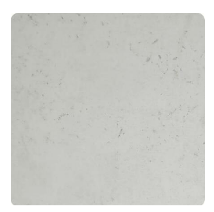
MS 005 (2.8% MS BASE 04)