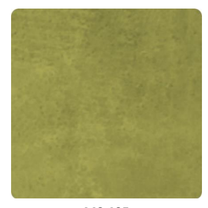
MS 405 (3% MS BASE 13 / 1% MS BASE 18)