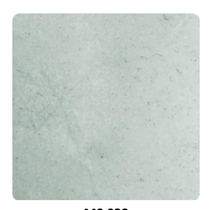
MS 032 (0.6% MS BASE 04 / 0.25% MS BASE 16)