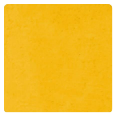
MS 204 (1% MS BASE 13)