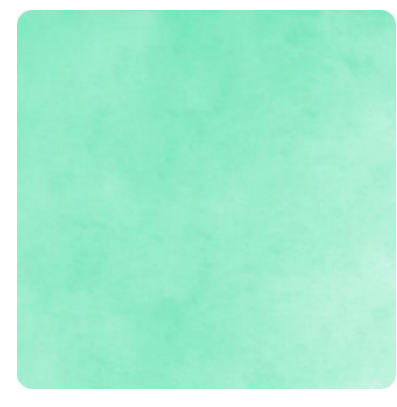
MS 402 (1% MS BASE 17)