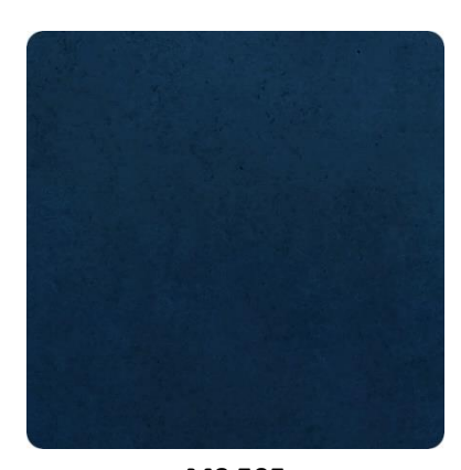
MS 505 (3% MS BASE 20 / 0.4% MS BASE 03)