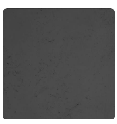
MS 006 (0.4% MS BASE 03)