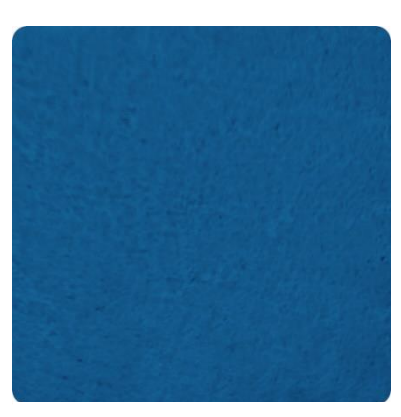
MS 503 (3% MS BASE 20)