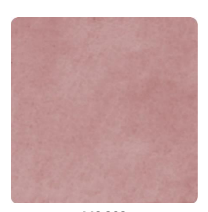
MS 302 (1% MS BASE 06)