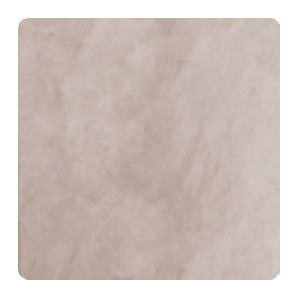
MS 107 (0.5% MS BASE 01 / 0.25% MS BASE 10)